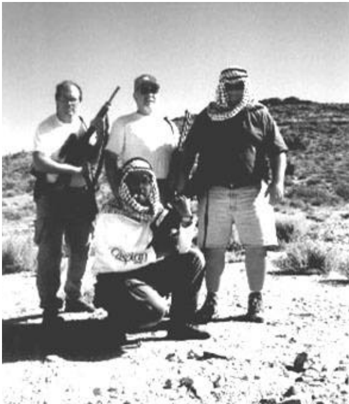
TEAM DESSERT THUG

Well as yall can notice from the announcements on the other side of this page; the election had no nominees other than the returning incumbents. It takes a lot of volunteer work to keep this group running and the returning committee members are appreciated. I do remember in 1991 when there were many candidates and a big election for all of the Hot Shot